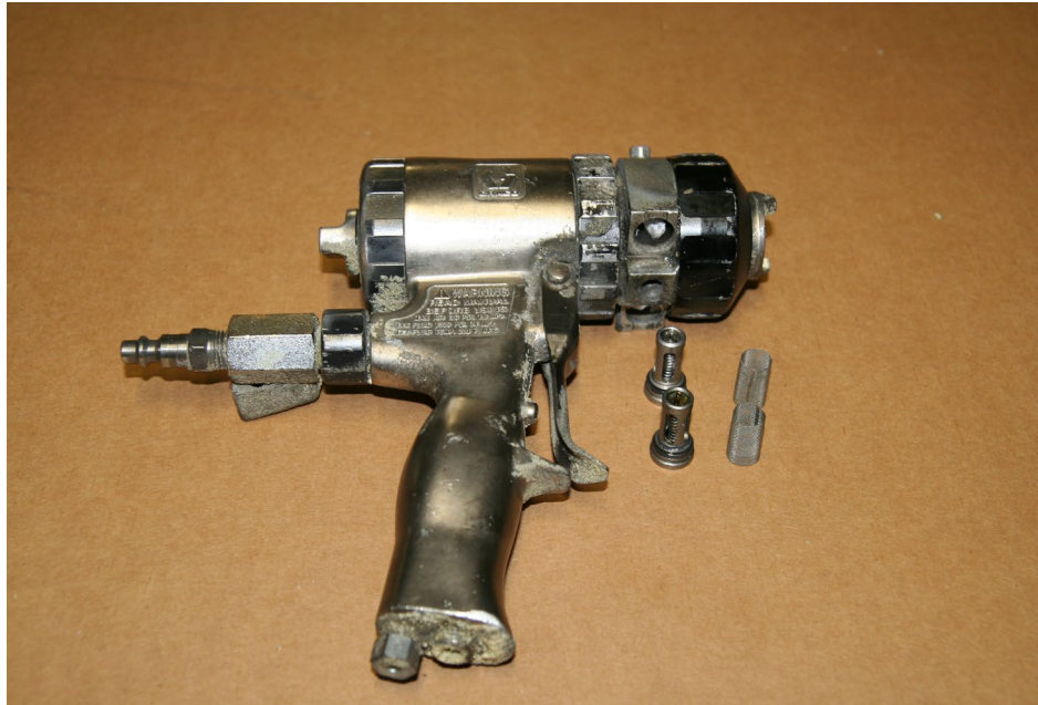
Graco Fusion AP Gun. Remove and leave out gun screens.