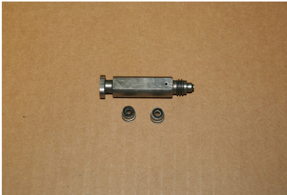
AR5252 mixing chamber and steel side seals for Graco Fusion AP spray gun