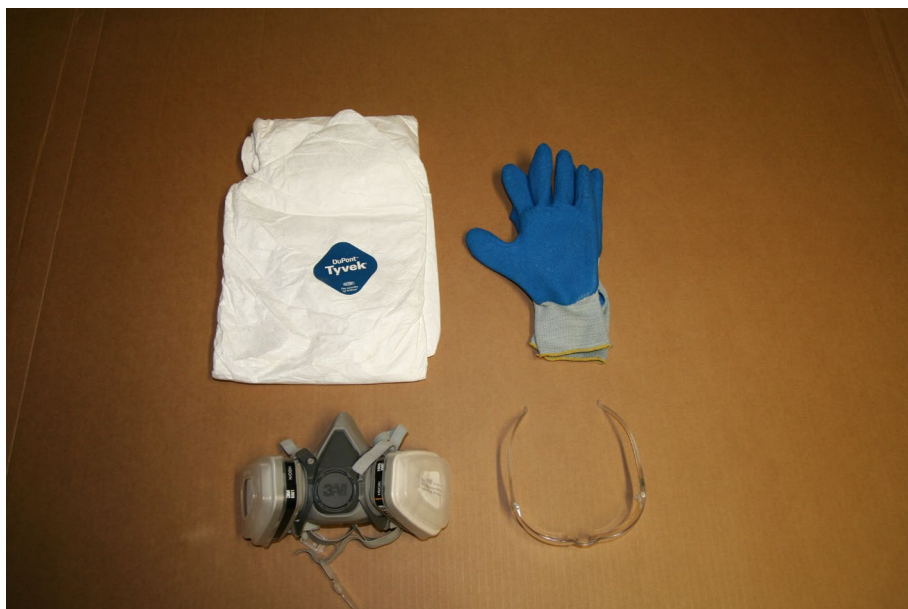
Examples of Personal Protective Equipment