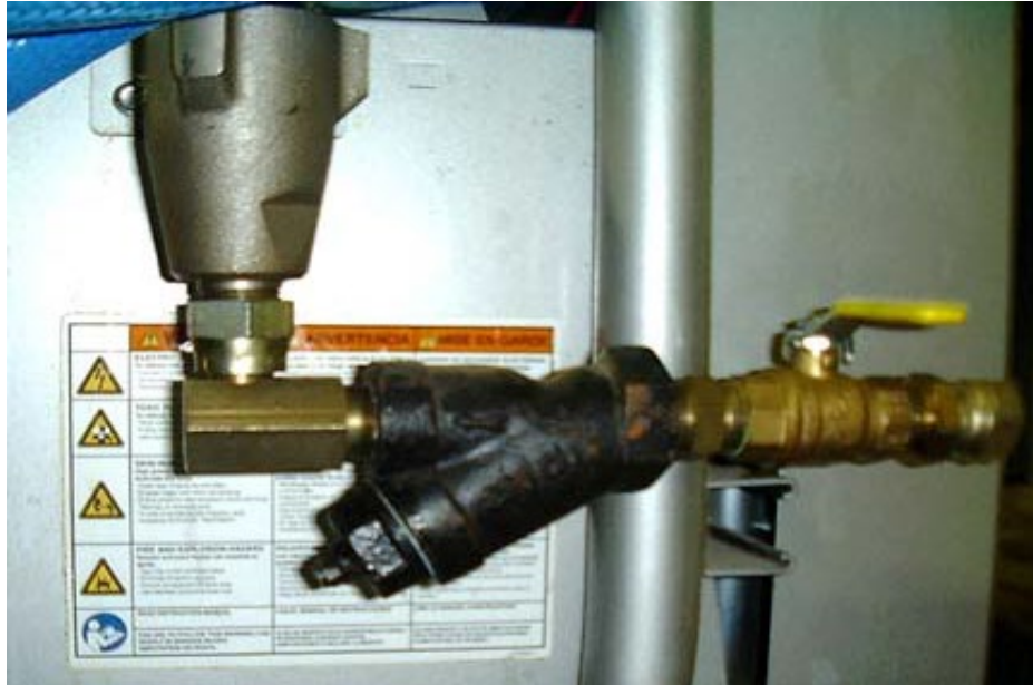
Standard Graco or PMC y-strainer